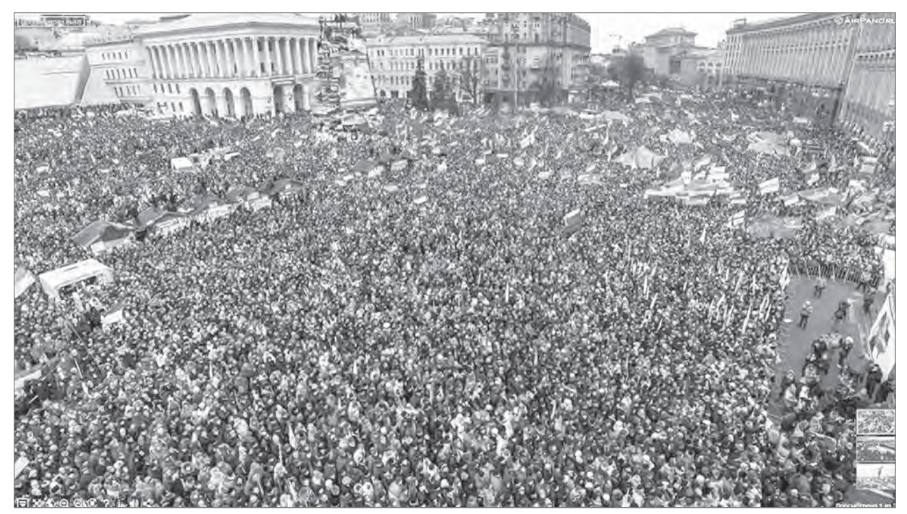
Figure 5: Independence Square, the Uprising of Dignity (Euromaidan) in Kyiv, 2014.

tories that were developed due to the construction of new subway stations - Amur Square (Amurs'ka ploshcha) and Holosiyiv Square (Holosiyivs'ka ploshcha) - as well as the exits from the Akademmistechko and Kharkiv (Kharkivs'ka) subway stations also have features of nodal areas. A number of Kyiv squares that were formed at the intersection of newly paved streets were not included in the list of existing nodal areas: Ankara Square (Ploshcha Ankary), Panteleimon Kulish Square (Ploshcha Panteleymona Kulisha), Kerch Square (Kerchens'ka ploshcha), Volgograd Square (Volhohrads'ka ploshcha), and Valeriy Marchenko Square (Ploshcha Valeriya Marchenka). Today, they only perform the function of road intersections and do not attract residents pursing leisure activities. We assume that eventually these territories will acquire additional functions due to their transport accessibility. At the same time, and in the case of preserving current trends, the space of these areas is under threat of being transformed into a routine landscape of shopping centres, kiosks, and shops on wheels.