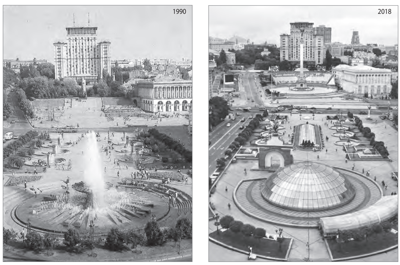
Figure 4: Independence Square: before and after the 2001 reconstruction.

site of the river station and underground (note the dominance of economic priorities), the area now faces enormous problems with the need for more parking spaces.