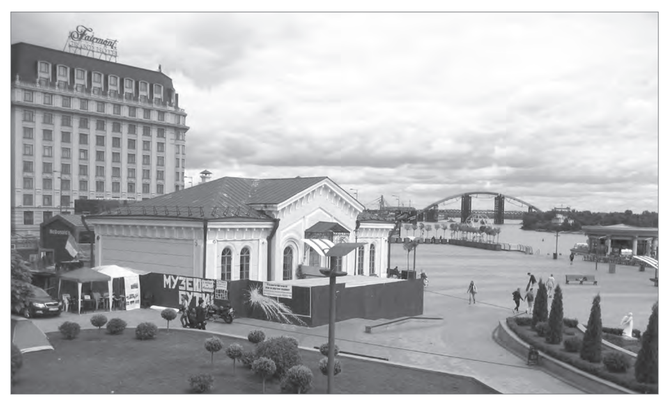
Figure 3: Postal Square, Kyiv, Ukraine. The sign on the fence reads "There will be a museum!".

processes described above, we next examine the current state and transformations of these three areas.