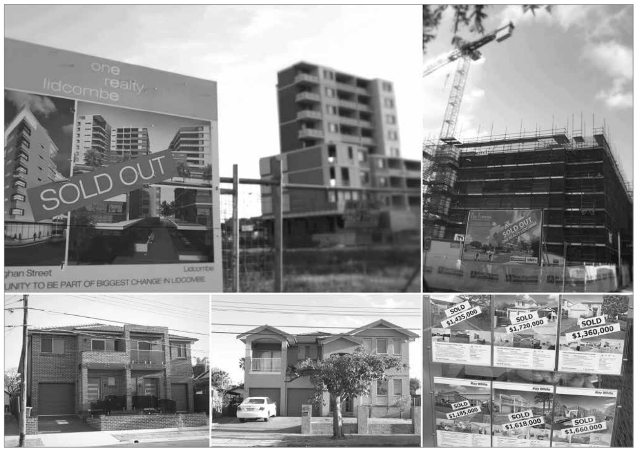
Figure 4: Property and apartment development in Lidcombe.