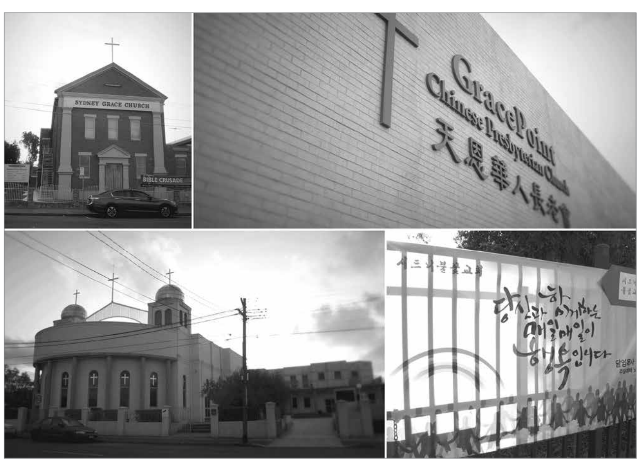
Figure 5: A sample of churches in Lidcombe.