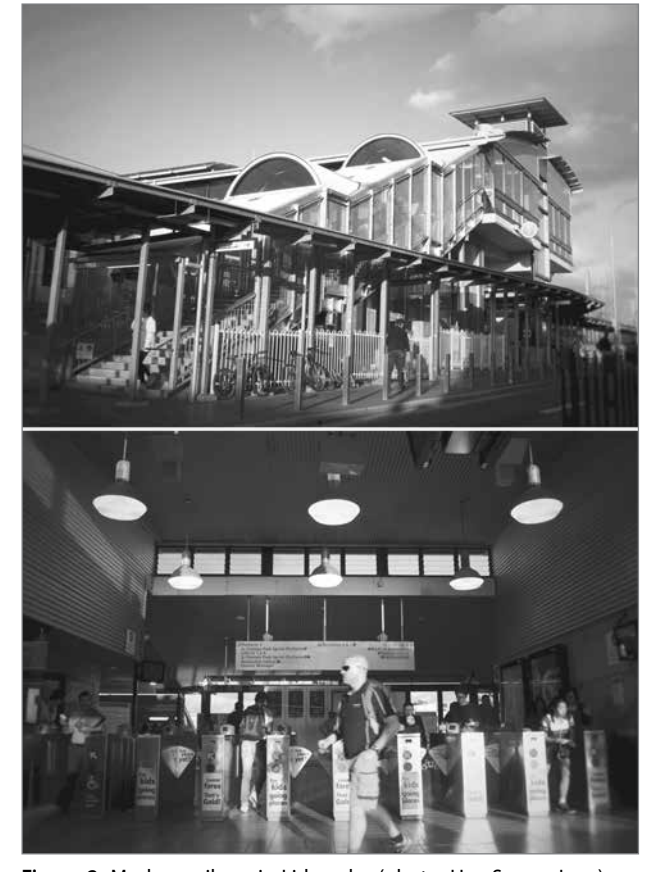
Figure 2: Modern railway in Lidcombe.