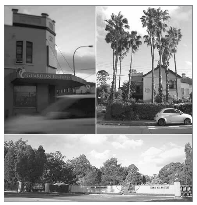
Figure 9: The funeral industry.

The interpretation of these income classes has changed over the years, and so it is important to understand Table 6 in conjunction with Figure 7. Looking at them together shows the palpable economic prosperity in the neighbourhood and conspicuous decline in deprivation, whereas incomes seem to be uniformly distributed. These migrants remit money and send gifts back to relatives in their countries and invest in their