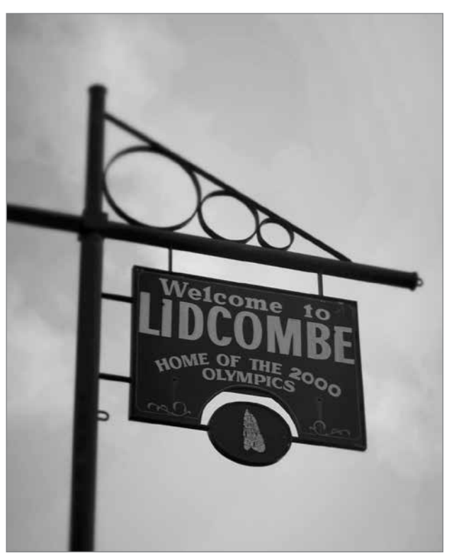
Figure 1: Lidcombe and the 2000 Olympics.

Relative to other years, migration to Australia was generally on the low side around this time (Collins, 2008). The political interest in globalisation was producing contradictory outcomes, especially in terms of concentrating wealth in the hands of a few people and making the majority of people worse off. The suburbs, especially those in the western part of Sydney (including Lidcombe), were not prospering and in fact seemed to be bearing the brunt of the forces of globalisation beginning to gain prominence in modern Australia. Business entities favoured the "importation" of migrant workers to fill shortages at the same time (Stilwell, 1998). Starting in 2000, however, there was a boom in migration to Australia (Collins, 2008) and, according to local accounts, to Lidcombe as well. Local Australian factors, especially the Olympics, were powerful magnets but there were strong push factors too. The 1997-1999 Asian crisis, for instance, led to considerable emigration from Asia (Castles, 2008). However, whether push or pull, 2000 was a watershed in the life of Lidcombe.