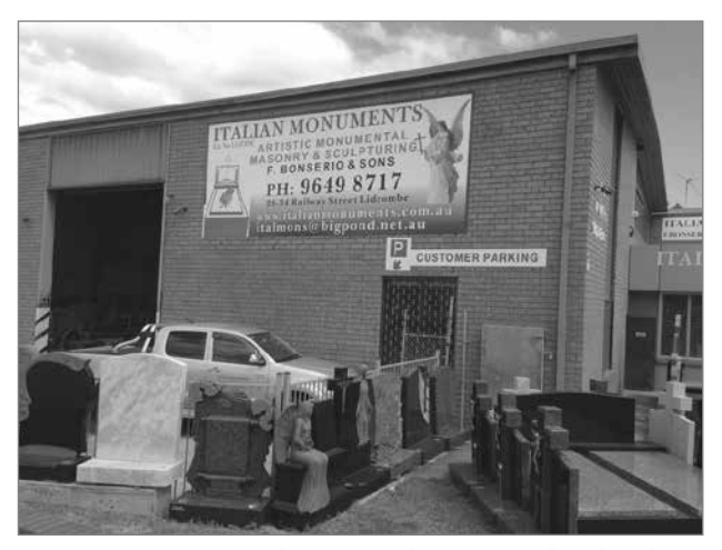
Figure 10: Gravestone and monument business in Lidcombe.

countries of origin. It would be interesting to study whether there are any differences between this process and how Africans in Sydney generally send remittances to Africa (Obeng-Odoom, 2010).