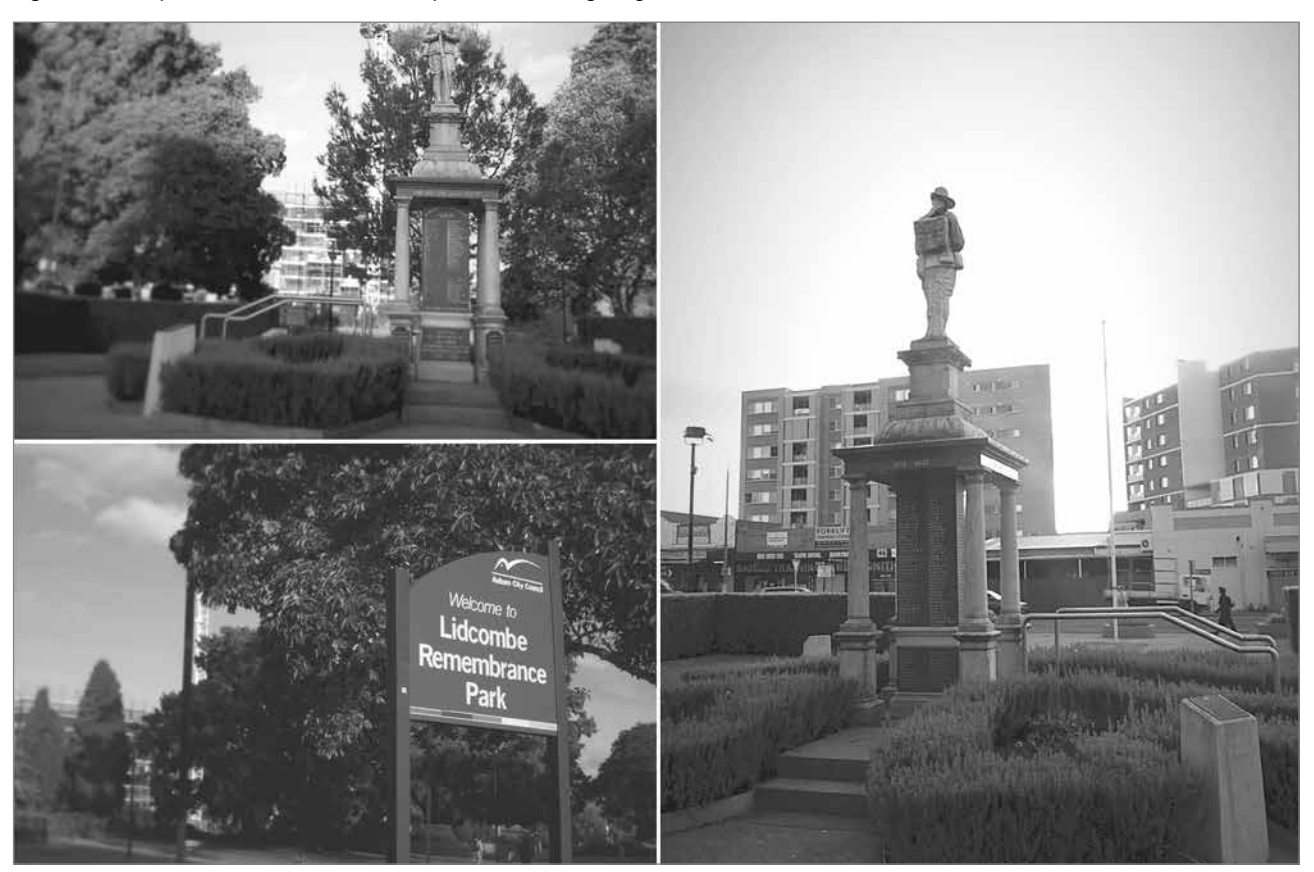
Figure 6: Lidcombe Remembrance Park.