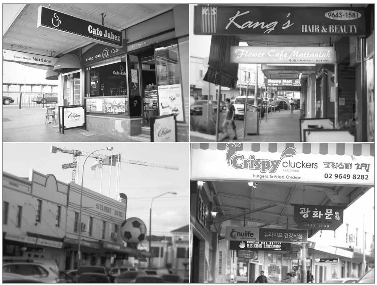
Figure 8: A major commercial precinct in Lidcombe.